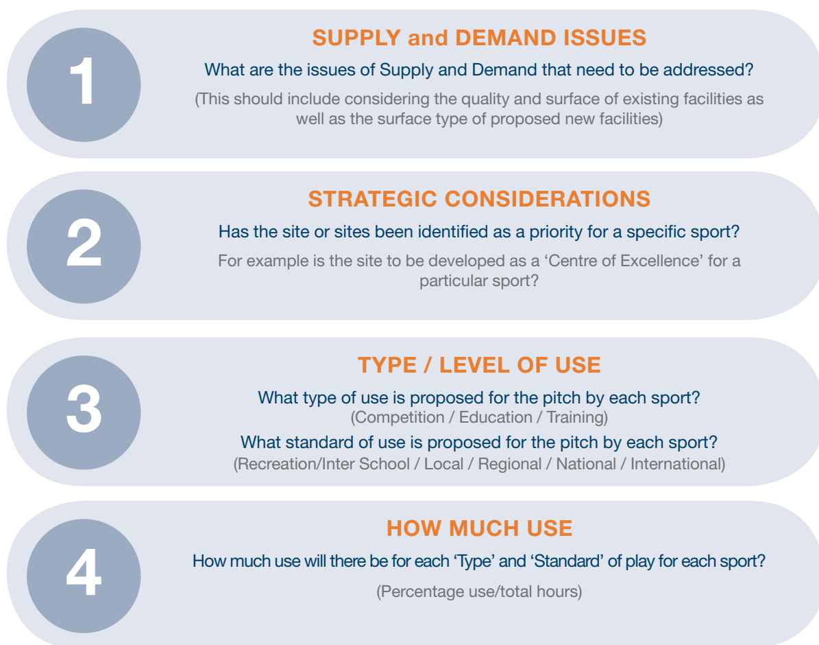
Figure 1: The 4 Step Process - The questions that need to be asked when gathering the information required to decide what surface type should be selected at different sites or at an individual location.